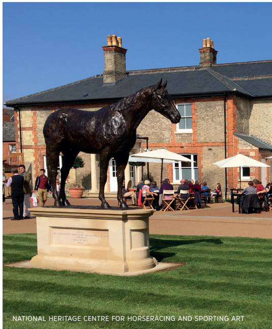
NATIONAL HERITAGE CENTRE FOR HORSE RACING AND SPORTING ART