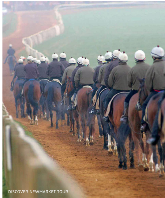
DISCOVER NEWMARKET TOUR